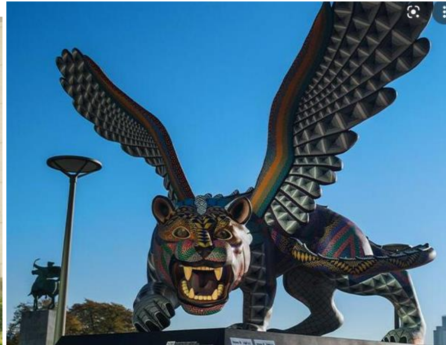
Statue outside UN Headquarters is a beast like that described in Daniel 7:2-4 – “a beast came up from the sea...like a lion, and had eagle’s wings”