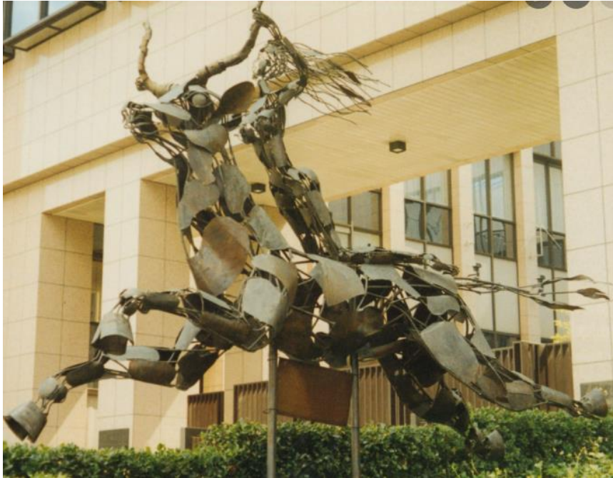
Statue outside EU Headquarters shows a woman on a beast.