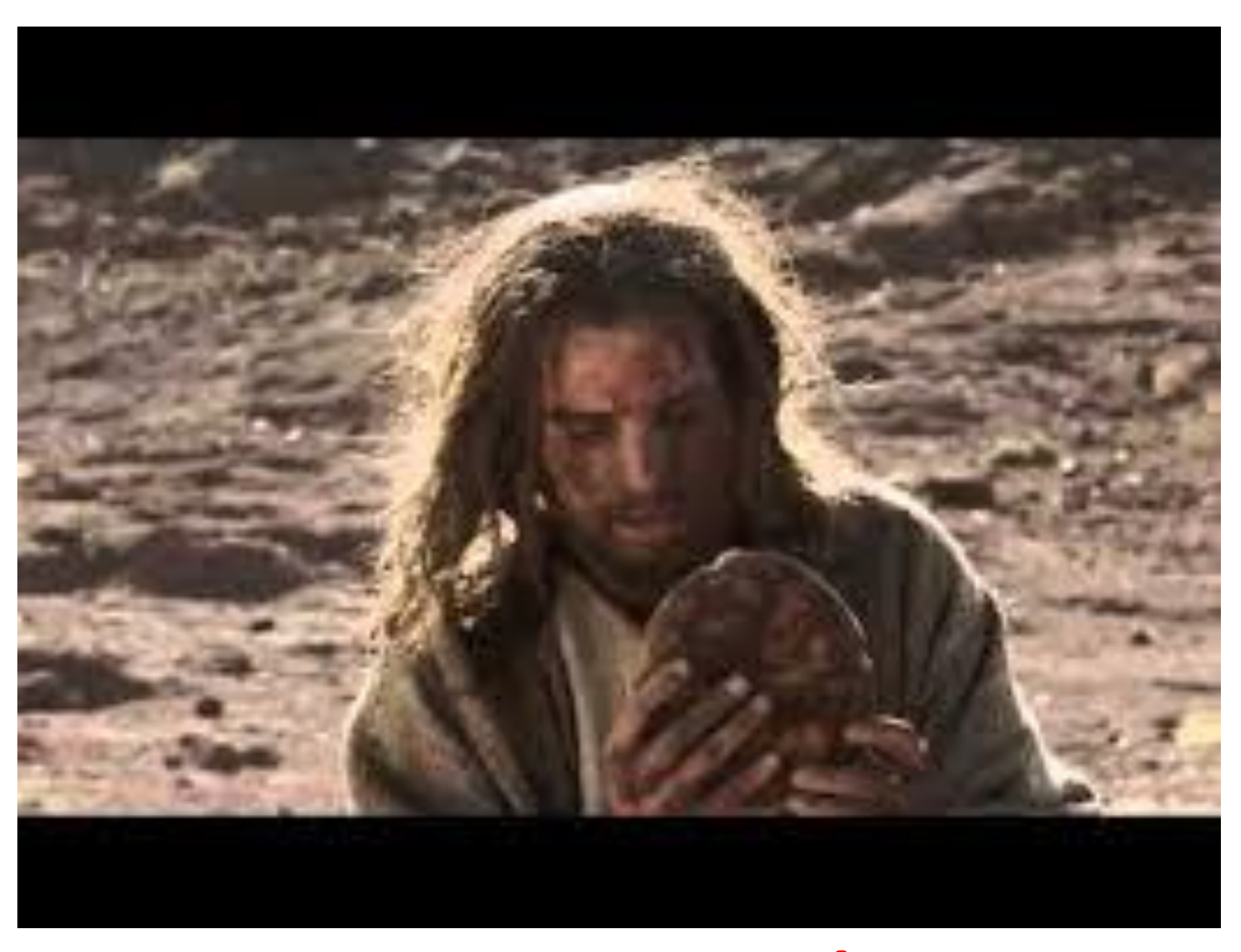
Lust of the Eyes/Flesh